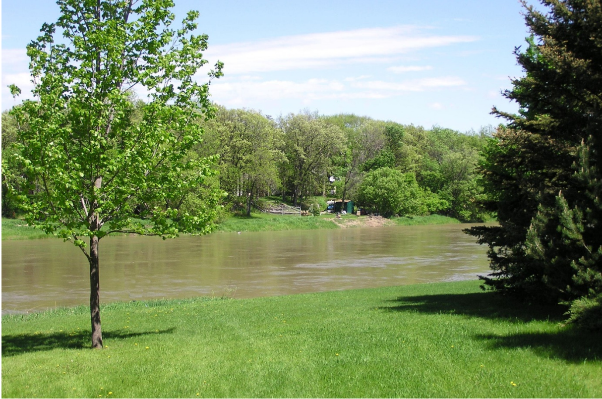
Site of the ferry located at the Passage

Métis This was one of the largest settlements of winter quarters for Métis Buffalo Hunters, who followed the great herds of Buffalo across the tall grass prairie every spring and fall. Métis settled all along the river in this area, the high ground of Charleswood being relatively safe from Spring flooding. Many Métis families lived in this area before the arrival of the Caron family. Transportation routes included cart trails South and West across the prairie as well as East/West boat and winter travel on the Assiniboine.