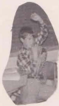
"Is it good Nelson?"