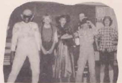
Our Class Uniforms