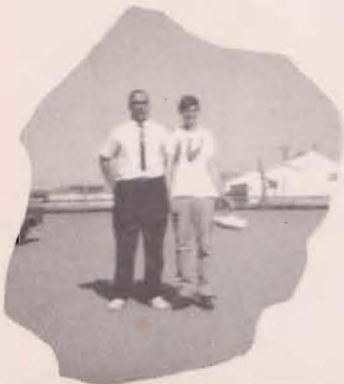
"My son the Graduate"