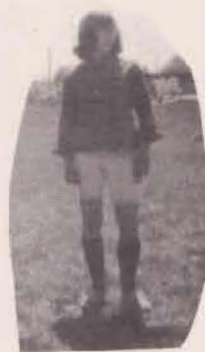
"Just try it - I dare you!"