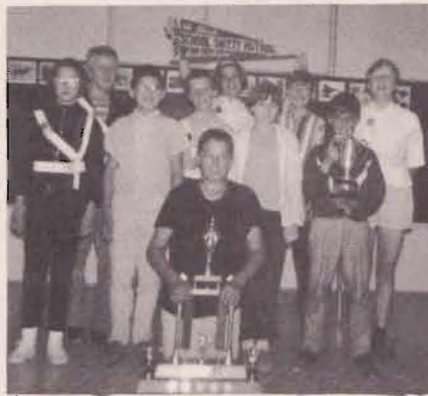
St. Charles Patrol's