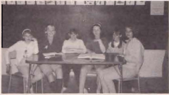
Year Book Committee