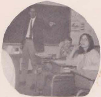
"They use Crest"