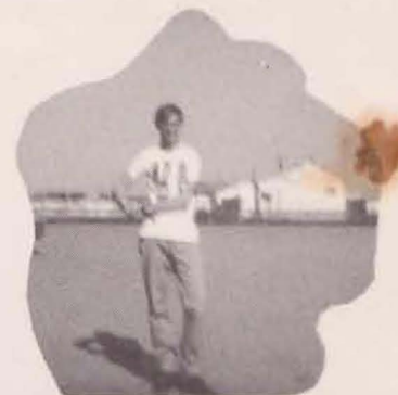
"So you broke your leg - I'M not a Doctor!"